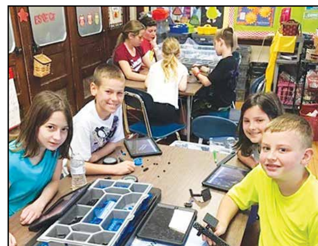
TV Intermediate fourth-grade students work together to learn about energy conversion.